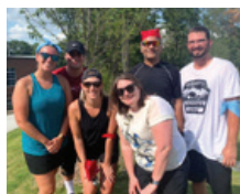
2019 KICKBALL TOURNAMENT

Unless otherwise agreed upon in writing between the company and the employee, health, and life benefits are provided to eligible full-time (scheduled to work 30 or more hours per week) employees who have worked at the company a minimum of 60 days.